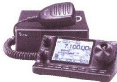
ICOM IC 7100

TICKET $10 EACH 200 TOTAL TICKETS DRAWING TO BE HELD WHEN LAST TICKET IS SOLD